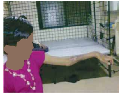
After 6 sessions of one hour each

The visco-elasticity changes at the microscopic level of the muscle leads to painful intramuscular hardenings such as myogelosis. These contracted muscle fibre are no longer available for motive work. Over the time, movements become limited and there are shortenings in the fascia system with resulting squeezing and impairment of the motion of the cells, vessels and nerves passing through the fascia. This produces visible avoidance motion with relieving postures and even growth disturbances (scoliosis) and muscular breakdown.