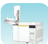
Optima Gas Chromatograph 3007