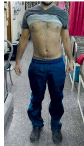
After 1 session of 2 hours.

Matrix Rhythm Therapy helps in activation of venous and lymphatic flow, acceleration of the thixotropic reaction from gel to fluid, reduction of viscosity, regulation of the interstitial pH value, increase of tissue temperature to normal temperature.