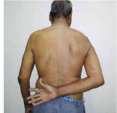
After 1 session of one hour

A healthy body does not feel any part. Positively motivated it enjoys life.