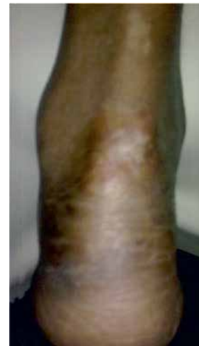
Result after three sessions