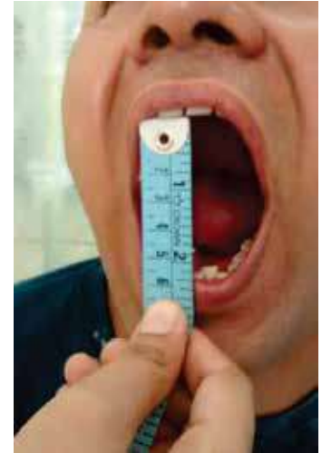
After 3 session of 1 hour each

Matrix Rhythm Therapy restores the good tissue resonance, characteristic for the skeletal musculature, by frequency and amplitude modulation. The applicator produces a lifting action at the same time as a horizontal micro extension movement, which is transferred to adjacent inner organs, bones and skin. As the neural tension is normalized, the venous and the lymphatic flow of the entire area of improved micro circulation is accelerated. Extra cellular matrix clearance increases.