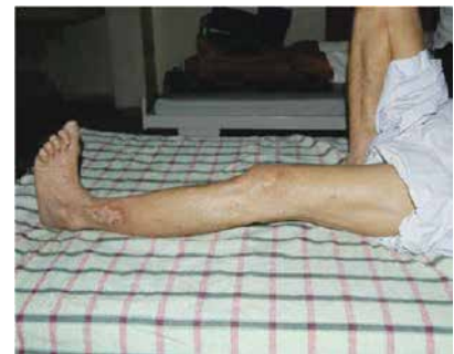
After 1 session of one hour

It is well known that a bone without covering the soft tissue after a surgically attended fracture can only heal with difficulties or not at all. Connecting tissue, muscles and fascias shortens because of reduced micro circulation, hypoxia of the tissue and ↓ATP for repolarization and relaxation.