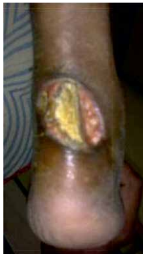
Case by: Dr. Sandeep Bhagwat, Solapur

Matrix Rhythm Therapy helps in activation of venous and lymphatic flow, acceleration of the thixotropic reaction from gel to fluid, reduction of viscosity, regulation of the interstitial pH value, increase of tissue temperature to normal temperature.