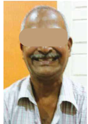
After 3 session of 1 hour each

By a subliminal sympatholytic and vagotonic stimulation of the proprioceptive field, imbalances resolves themselves also in the fasciae whereby the tonus of the tissue is generally normalized and the resonator quality is increased.