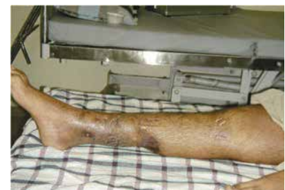
After 10 sessions of one hour each