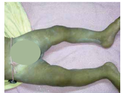
After 3 session of 30 mins. each